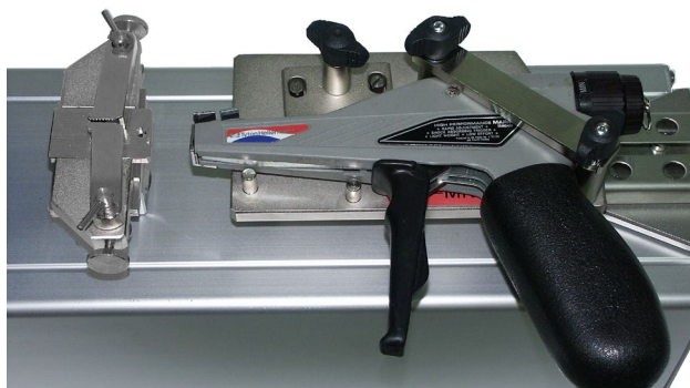
HellermannTyton MK 7 with GT-Touch 50 and KSH 6 clamps